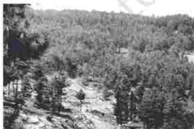
Figure 5.5 : Montane Forests

The Himalayan ranges show a succession of vegetation from the tropical to the tundra, which change in with the altitude. Deciduous forests are found in the foothills of the Himalayas. It is succeeded by the wet temperate type of forests between an altitude of 1,000-2,000 m. In the higher hill ranges of northeastern India, hilly areas of West Bengal and Uttaranchal, evergreen broad leaf trees such as oak and chestnut are predominant. Between 1,500-1,750 m, pine forests are also well-developed in this zone, with Chir Pine as a very useful commercial tree. Deodar, a highly valued endemic species grows mainly in the western part of the Himalayan range. Deodar is a durable wood mainly used in construction activity. Similarly, the chinar and the walnut, which sustain the famous Kashmir handicrafts, belong to this zone. Blue pine and spruce appear at altitudes of 2,225-3,048 m. At many places in this zone, temperate grasslands are also found. But in the higher reaches there is a transition to Alpine forests and pastures. Silver firs, junipers, pines, birch and rhododendrons, etc. occur between 3,000-4,000 m. However, these pastures are used extensively for transhumance by tribes like the Gujjars, the Bakarwals, the Bhotiyas and the Gaddis. The southern slopes of the Himalayas carry a thicker vegetation cover because of relatively higher precipitation than the drier north-facing slopes. At higher altitudes, mosses and lichens form part of the tundra vegetation.