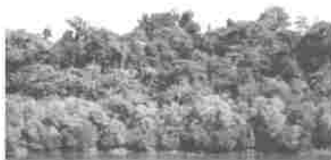
Figure 5.1 : Evergreen Forest

The semi evergreen forests are found in the less rainy parts of these regions. Such forests have a mixture of evergreen and moist deciduous trees. The undergrowing climbers provide an evergreen character to these forests. Main species are white cedar, hollock and kail.