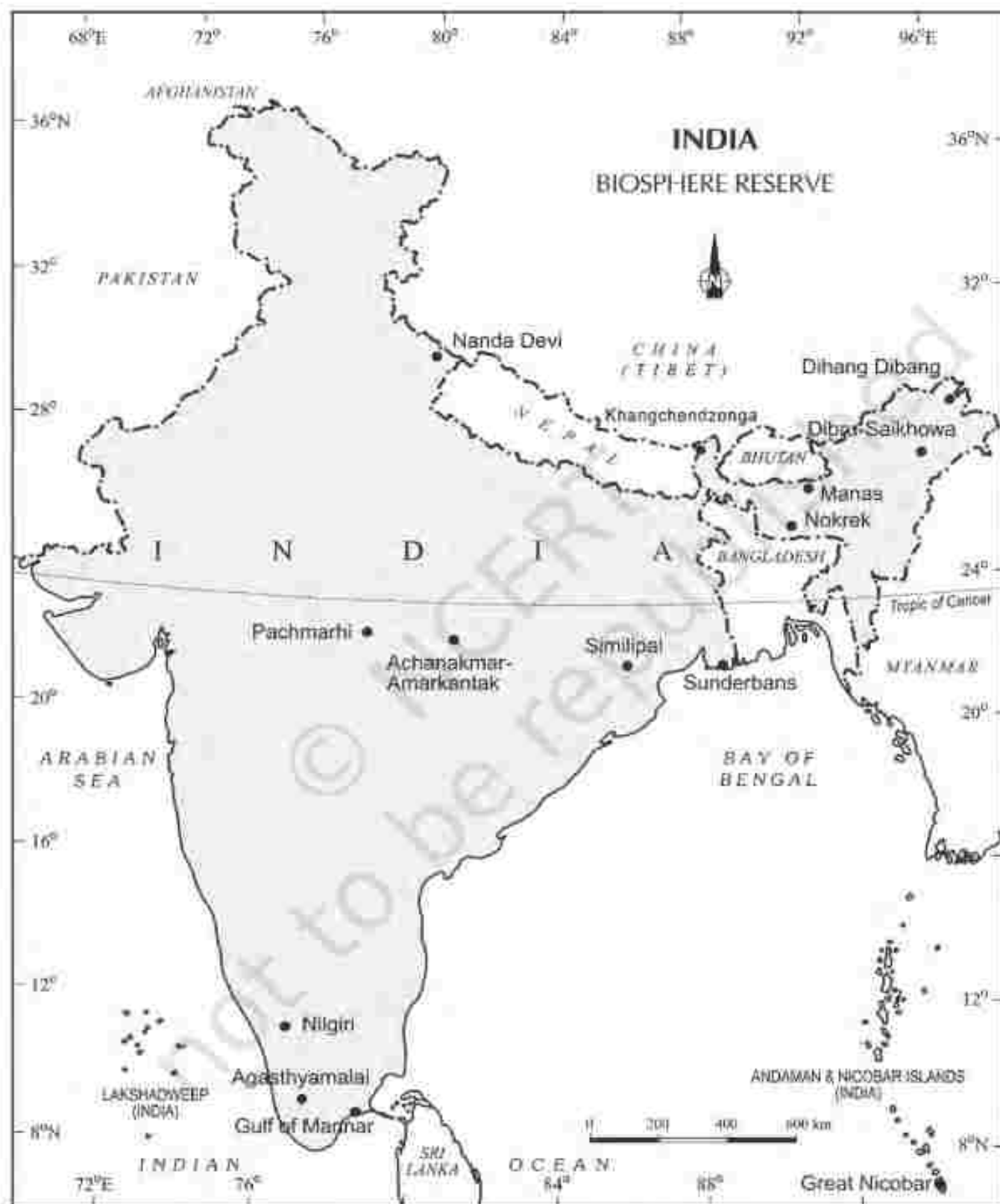
Figure 5.8 : India : Biosphere Reserves