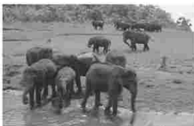
Figure 5.7 : Elephants in their Natural Habitat

For the purpose of effective conservation of flora and fauna, special steps have been initiated by the Government of India in