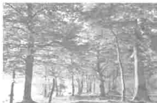
Figure 5.3 : Deciduous Forests

These are the most widespread forests in India. They are also called the monsoon forests. They spread over regions which receive rainfall between 70-200 cm. On the basis of the availability of water, these forests are further divided into moist and dry deciduous.