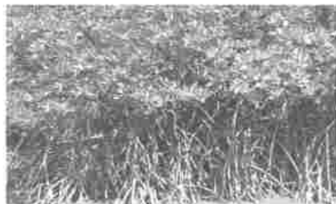
Figure 5.6 : Mangrove Forests

They consist of a number of salt-tolerant species of plants. Crisscrossed by creeks of stagnant water and tidal flows, these forests give shelter to a wide variety of birds.