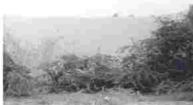
Figure 5.4 : Tropical Thorn Forests

Tropical thorn forests occur in the areas which receive rainfall less than 50 cm. These consist of a variety of grasses and shrubs. It includes semi-arid areas of south west Punjab, Haryana, Rajasthan, Gujarat, Madhya Pradesh and Uttar Pradesh. In these forests, plants remain leafless for most part of the year and give an expression of scrub vegetation. Important species found are babool, ber , and wild date palm, khair, neem, khejri, palas , etc. Tussocky grass grows upto a height of 2 m as the under growth.